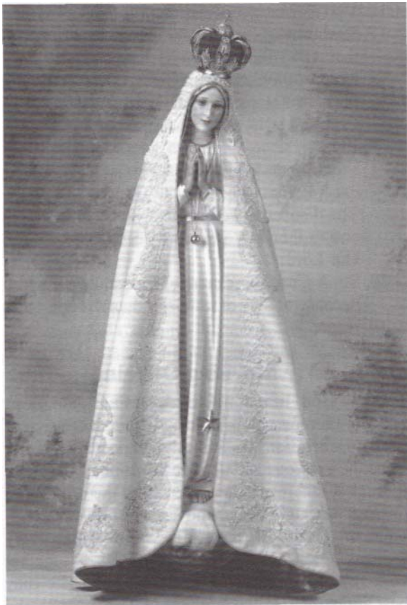
International Pilgrim Virgin Statue of Our Lady of Fatima

I wish to be counted among those who are willing to do the simple things Our Lady asks. Please have my name flown to Fatima.